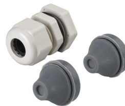
CoreLine Waterproof WT120C G2 PCU-3DPP