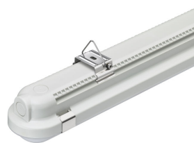
CoreLine Waterproof WT120C G2 PCU-9DPP