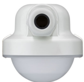
CoreLine Waterproof WT120C G2 PCU-12DPP