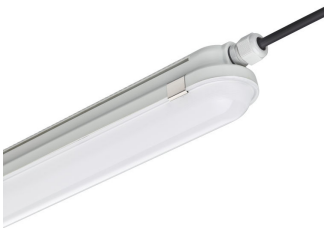
CoreLine Waterproof WT120C G2 PCU-7DPP